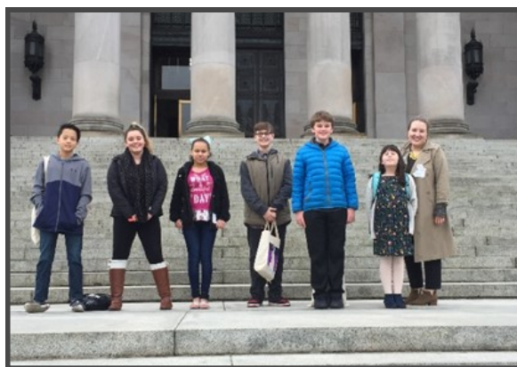
Family Services Advocacy Day, Capitol Building, Olympia

Currently, at the Arc, I have the great privilege of coordinating both our sibling programs and our advocacy efforts. At each Sibshop we host, I hear the kids' stories of the joys and the hard things about having a sibling with a developmental disability. I am continually impressed with their maturity and deep understanding of what their family and siblings need to succeed.