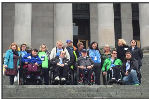
Disability Pride Advocacy Day, Capital Building, Olympia